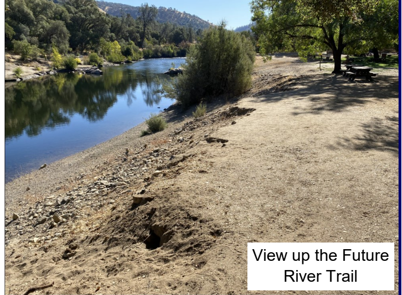
View up the Future River Trail

Currently the North Beach River Access is comprised of a rough unimproved river access and boat launch area. The launch area, the upstream informal beach access and the river embankment between these two areas is eroding and in need of restoration. The current shoreline trail along the North Beach area is an informal trail. Formalizing and improving this trail into an accessible trail experience would benefit park visitors. The shoreline trail is consistent with the Coloma-Lotus Sustainable Community Mobility Plan.